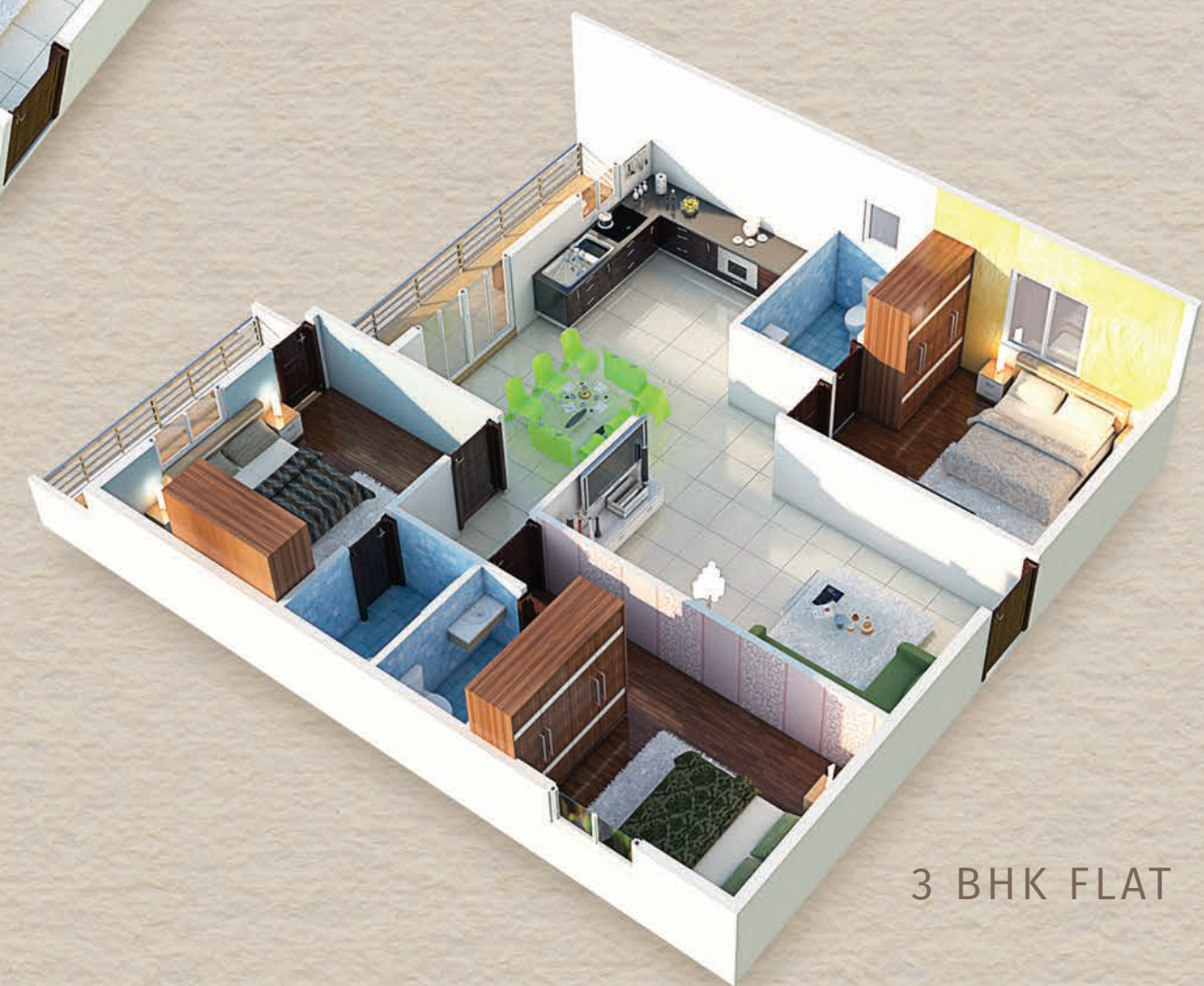
3 BHK FLAT

NVR Sun Pearl BLOCK-B 2 & 3 BHK LUXURY APARTMENTS