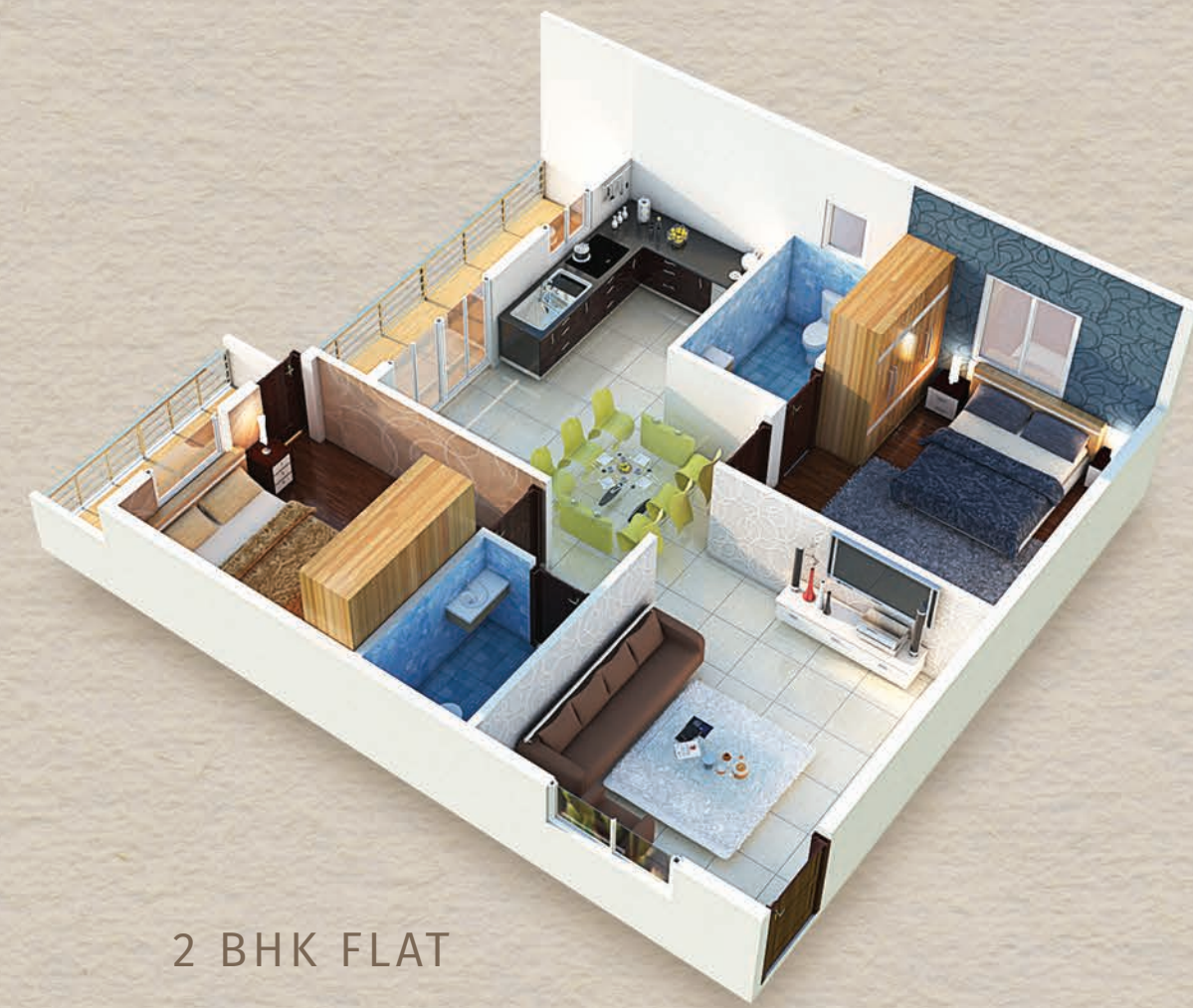
2 BHK FLAT